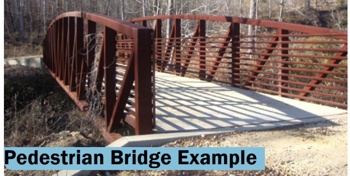
Pedestrian Bridge Example

establish community connectivity within the District, thereby allowing neighbors both on foot and on bike to easily move about the area. This additionally allows residents in Oak Park Trails to easily reach Westgreen Drive and allows residents in Westgreen Park to reach South Mason Road.